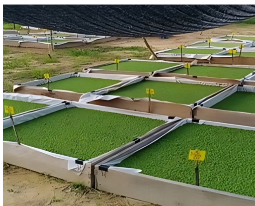
Figure 1. Experimental design overview with 1 m x 1 m artificial ponds

Azolla microphylla , inoculated at 100 g fresh weight (FW) per 1 m 2 pond (i.e., 100 g FW/m 2 ) followed previous research (Pouil et al., 2022), underwent cultivation. Each pond received 3 kg of cow manure (i.e., 30 tons/ha) one week before the experiment's initiation. Throughout the cultivation process, phosphorus fertilizer (superphosphate 36%) was applied three times at 20 g intervals (i.e., 200 kg/ha). The first application, 6 g per pond, occurred two weeks after the initial inoculation. The second application, 6 g per pond, followed the second harvest, with an additional 8 g per pond applied after the third harvest.